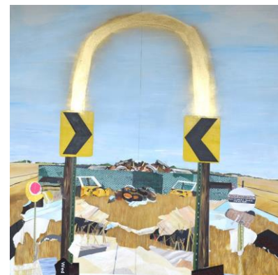
Miscalibration: Sacred Profane , acrylic, colored pencil, ink, flashe, paint pen, glitter on canvas, 72" x 72". 2019.