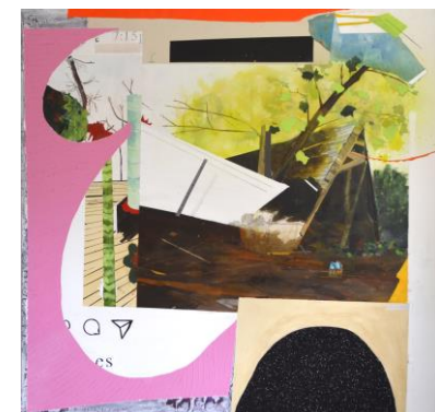
715 pm es, acrylic, colored pencil, ink, flashe, paint pen, spray paint, glitter on canvas, 66" x 66", 2018.